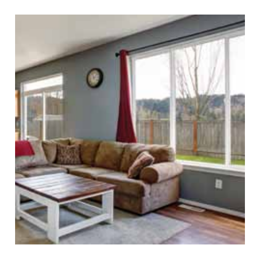
2 & 3 Lite Sliders Create a custom look for a special room