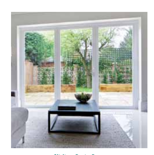
Sliding Patio Door Create light and inspirational views in your living space