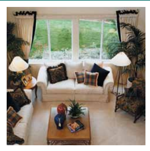
Slider Windows A great choice when space is at a premium