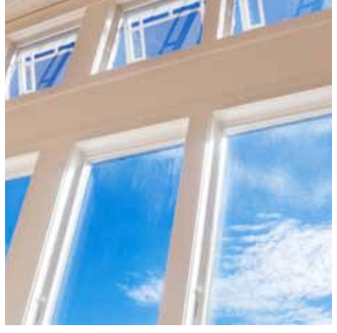
Combination Windows Dramatically emphasize the living space