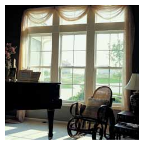
Double-Hung and Transom Windows Bring added height and light to any room setting