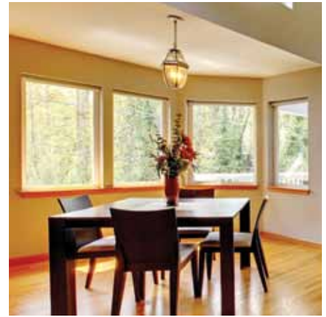
Picture Window Walls Offers maximum viewing area and opens the room to the outside beauty